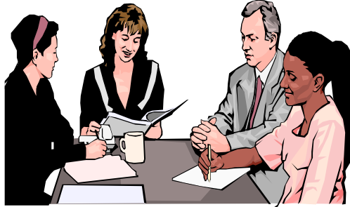
New Faces bring New Ideas. Refreshments and snacks are always provided at the meetings each month

CNOR and RNFA scholarships were available through Central Ohio AORN for any member who will get certified or recertifies this year. Just visit our web site at www.centralohioaorn.com for qualification rules and an