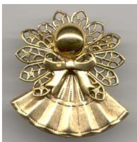
Angel Pin #252 $10.00