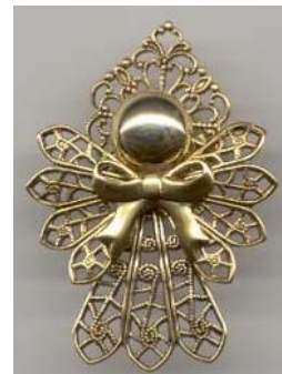
Angel Pin #286 $10.00