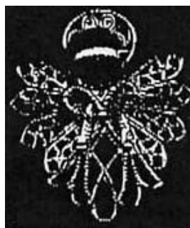
Angel Pin #271 $10.00